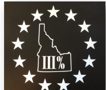
(U) Idaho III%, active participants at the Malheur Wildlife Refuge Occupation