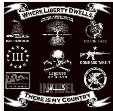
(U) Images commonly associated with ME and SCE