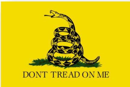
(U) Gadsden flag, commonly displayed by sovereign citizen extremists

(U//FOUO) Below are some visual indicators of these potential extremist and disaffected individuals: though some or parts of these symbols are representative of patriotic and American revolutionary themes; they are often associated with extremism: