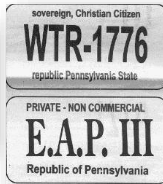
(U) Self-produced license plates often used by sovereign citizen extremists