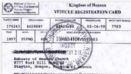
(U) False vehicle identification card often associated with sovereign citizen extremists