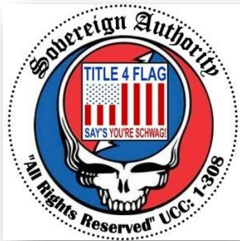
(U) Common sovereign citizen imagery