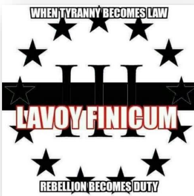
(U) III% Badge being displayed via social media, honoring Finicum