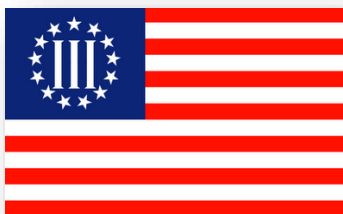
(U) III% symbol, synonymous with militia members present at the Malheur Wildlife Refuge occupation